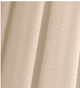
Cream 1" Box Pleated Silk - Translucent ( CPS )