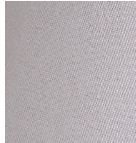
White Linen - Translucent ( WLT ) Opaque ( WLO )