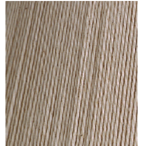
Beige Hand Wrapped Cotton String - Translucent ( BCS )