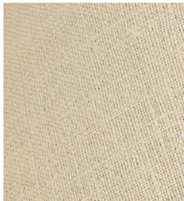
Beige Linen - Translucent ( BLT )