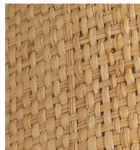
Natural Madagascar Cloth - Translucent ( NMT )