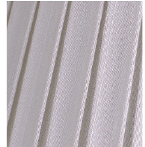
White 1" Box Pleated Silk - Translucent ( ONW )