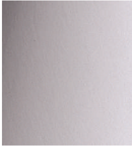
White Matte Paper - Translucent ( WTP )